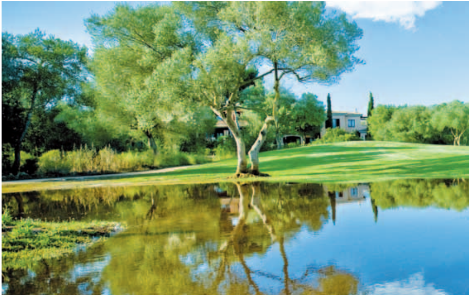
ABB SACE has always taken the ecological footprint of its products into account during each stage of their life: from production to disposal.

This is why the new SACE Tmax XT moulded-case circuit-breakers have been designed, developed and produced in accordance with the International EPD system (Environmental Product Declaration), with the aim of limiting the use of raw materials during the construction stage with consequent reduction of the material which will have to be recycled in future.