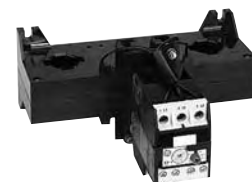
RT5 Overload Relay