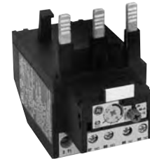
RT2 Overload Relay