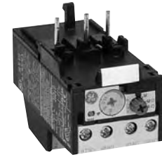
RT1 Overload Relay