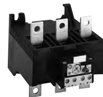
RT3 Overload Relay